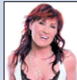
Jo Dee Messina

Jo Dee Messina is an award-winning, multi-platinum recording artist. Her latest release, "Delicious Surprise," is her fourth album.